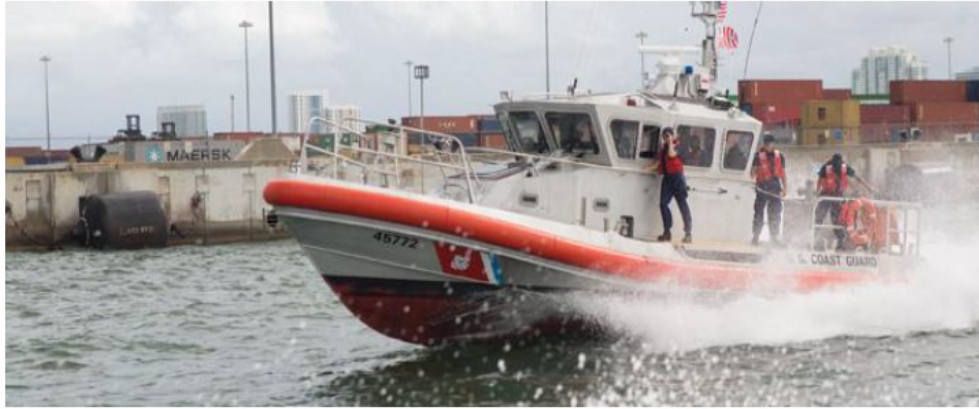
Your Coast Guard In Action

STAYING “MILITARY STRONG” with support for ALL VETERANS “As long as there is one veteran, we will never forget.”